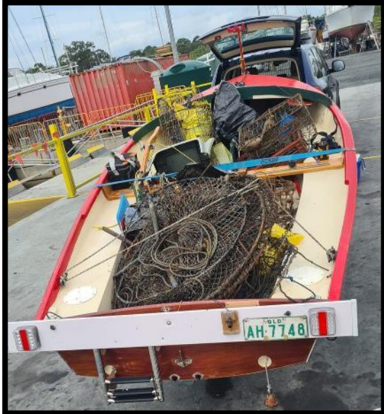
Jim's newly renovated Mirror 16 was used as a "garbage truck".