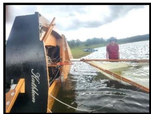
"Don't let go of the mast!"