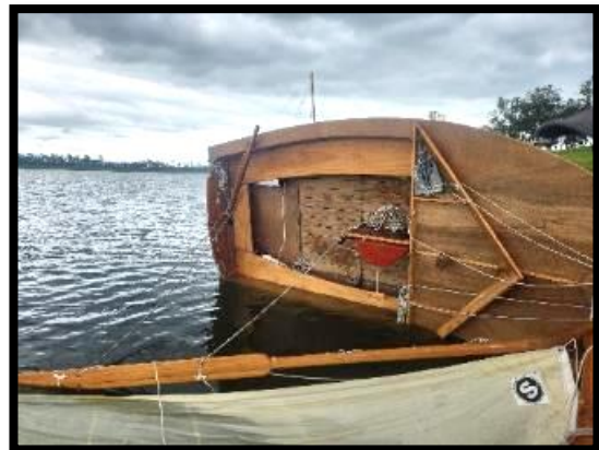
Over she goes.