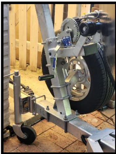
As a spare