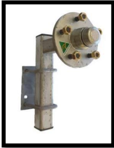
The Rescue Hub