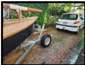
Wheel down - Ready to launch