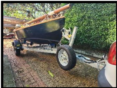
On the road ready

Actually it's a tale of 3 (or 4) kayaks. For years I enjoyed trundling around the eastern half of Australia in my red troopy, minimalist camping often on the banks of rivers or lakes. The idea of having a boat with me took hold but it had to travel inside not on a trailer or the roof so it would be ready for instant use. If I folded the front passenger seat down there was about 9' 6" space between the rear door and the windscreen. Paul Hernes pointed me towards Ross Lillistone's Water Rat ; the short version is 9 feet long. I built the boat in 6 weeks over the Christmas period in 2015 and you can read about that in my blog . I paddled "Rakali" for years in all sorts of places from the mouth of the Murray to Bundaberg. Here we are at the Dig Tree camp on Cooper Creek.