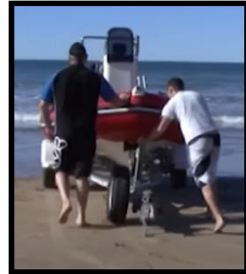
In use by others