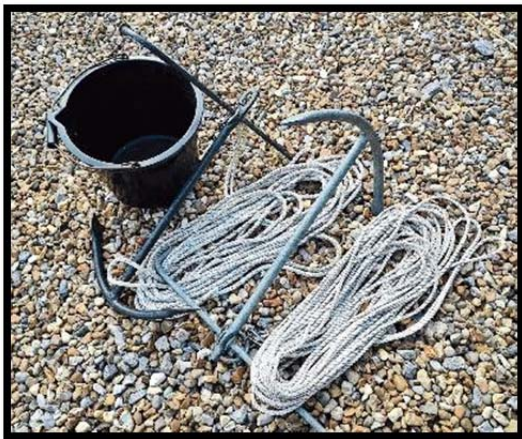
Anchors and warps / cables. You will definitely need an anchor, preferably two for overnight stops. There are endless arguments over which type is best, but these are mine. Remember you may find your anchor attached to the foreshore or dry land as often as the sea bed.