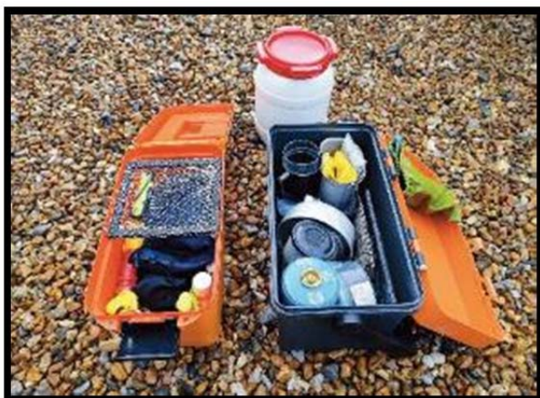
Containers for your gear. Mine range from waterproof, like the screw-on red top watersports tub for stuff that needs to stay dry, such as car keys, phone, etc., to semi-waterproof – the orange box on