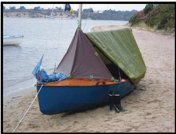
Enterprise on the beach with a two-piece boat "tent," using a standard sized poly tarpaulin and a cut-to-shape brown groundsheet

Living on board an Enterprise. Most people find boats around this size (13 feet 4 inches), practical only for solo camping aboard. Something around the size of a Wayfarer (15 feet 10 inches) might be more suitable for two.