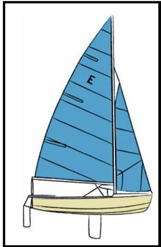
The Enterprise Dinghy. Its blue sails are as much a recognised feature as the red sails on a Mirror

If you own a dinghy and race it at your local club, can you use the same boat for cruising, without modifications that will take it out of class? The chances are you can and if it’s a boat people tell you is too “tippy” for cruising, all it may need is an effective way of reducing the sail area. Maybe your boat has a square gooseneck connecting the boom to the mast, in which case you could use roller reefing. Failing that a cheap set of second-hand sails from another class could be used to tame it. There are two