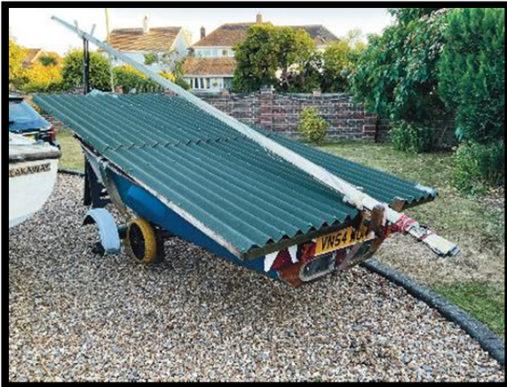
Wooden boat? You need to keep rain water out. This is my solution.