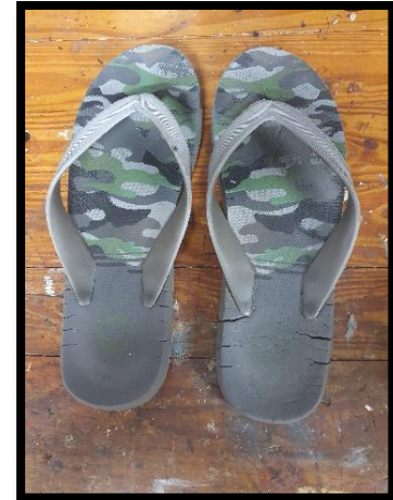
Favourite thongs - Before

Don't you hate it when the strap pulls through the thong sole? So, if you break your favourite thongs (the ones for your feet – not the other sort) you can repair them by slipping a bread clip over the strap that goes through the rubber sole.