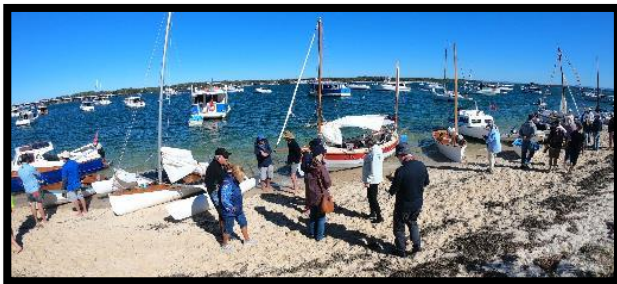
Boats at the beach and moored offshore.

This well –organised event is getting bigger and better with 90+ boats registered. It draws a huge crowd of interested viewers and is great for promoting tourism and Bribie in particular.