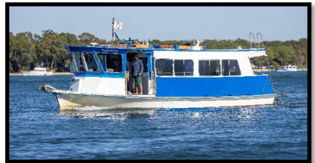
Two ex Brisbane cross-river ferries