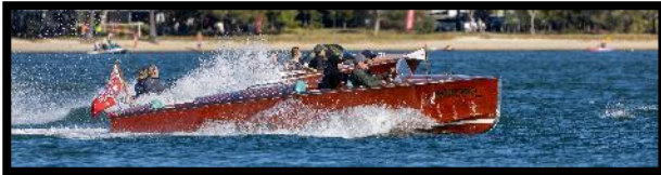
There were a few muscle boats

There was a People's Choice award for the public to pick their favourite boat.