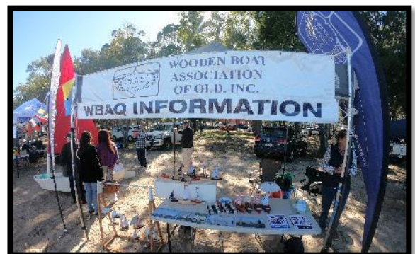
This was our stand.

The Joey Raffle was drawn with a second prize of Boatcraft products and a third prize – a WBAQ membership. Three happy people but 397 disappointed ones.