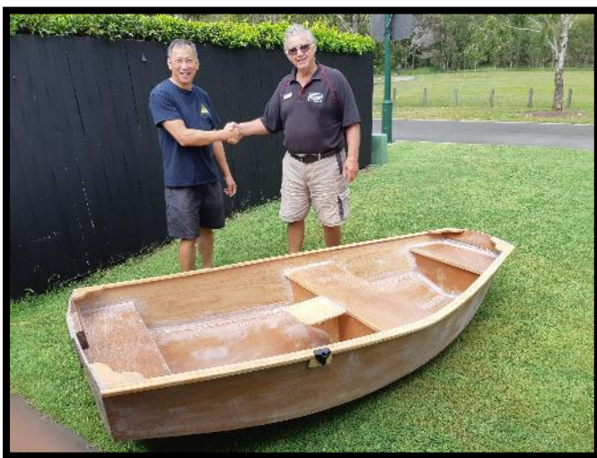
Horizon Shore Dinghy Lucky Door Prize

2020 was a year without any of our normal boat show events, as Brisbane boat show and Maleny wood expo were both cancelled.