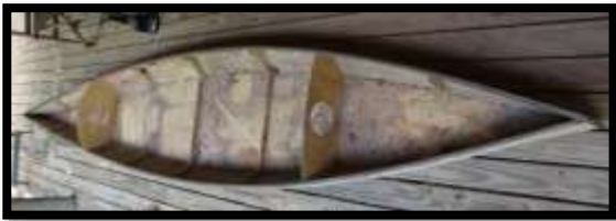
CANOE Polynesian in appearance – could add an outrigger to make an interesting boat