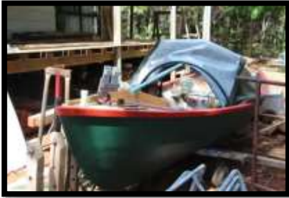
KAYAK – Flat bottomed and in need of a deck