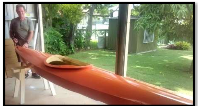
Ready to Launch!