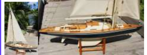
Height 800mm x Length 600