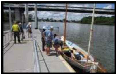
At the Hub

They claimed to be on a luxury observation cruise up the river, some people have a good life. It was a slow trip back up the river for me, being the smallest craft and with the tide at full run out I was the last to return to the ramp. Speaking for myself I really enjoyed this messabout on the river.