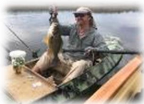
When the going gets tough- The tough go fishing!