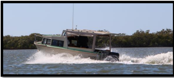
Nooroo at Caloundra