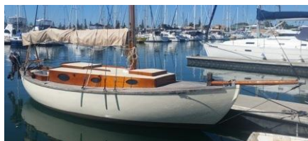
PIXIE - Winner of the WBAQ AWARD for best spars