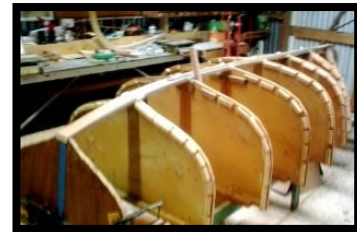
Mold for the raffle prize

Projects under way in their well-equipped boat shed included restoration of a donated traditional wooden hull, construction of a raffle prize for the next festival and production of simple model kits sold as a fund-raising and wood-working skills exercise.