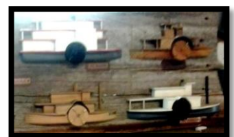
Model kit and models