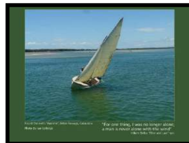
Example - August