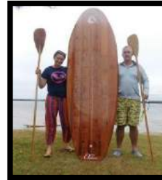
Proud father and Daughter with SUP

The finished board is covered with 200gsm fibre glass. The paddle blade was made using scrap from the deck.