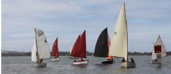
The Russell Lanigan Race underway

The weather was good with enough wind for the sailboats and the water was crystal clear. After smoko, some headed down toward the Caloundra Bar and then it was lunch back at Military Jetty beach.