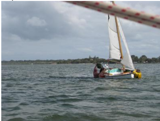
To the Rescue