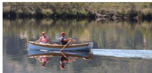
Rowing "ROE" on the Franklin