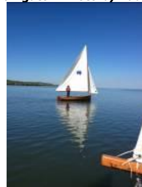
Jim Inglis setting out for the day, not much wind but enough for Jim.