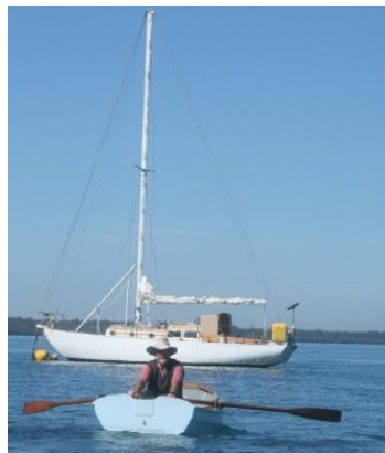
Trevor rowing out to Nimmitabel 2008

The job was finished at the end of February and this boat is now in great condition that will ensure that Trevor can enjoy it for a long time to come.