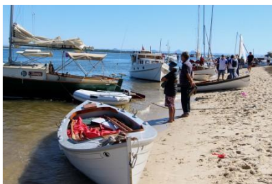
On the Beach at Bribie

Beautiful weather and a great location for this regatta.