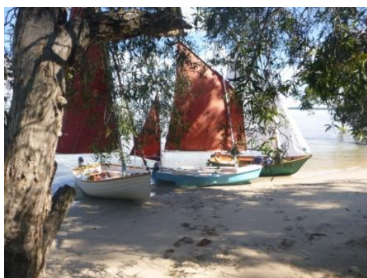
This is Island camping...

All in all the messabout was a success even though lacking enough wind at times. Whenever our members come together however, the spirit of camaraderie and shared interest ensures that a good time is enjoyed by all. The days were stunning, the scenery glorious and the birdlife abundant. What more can you want?