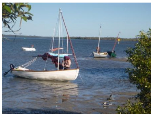
Camping at Lion's Boulevard Park