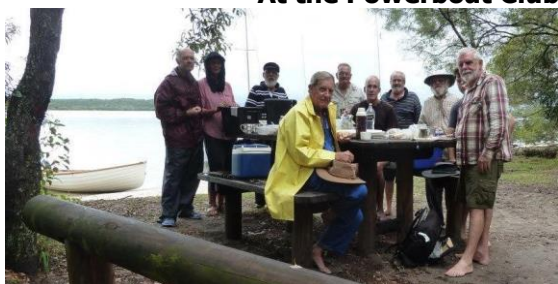
At Mission Point