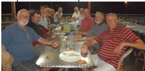
At the Powerboat Club