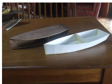
Ross's concept models

http://www.duckworksmagazine.com/15/columns/guest/dan7/index.htm