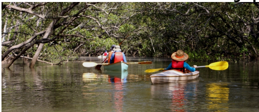
Through the Everglades