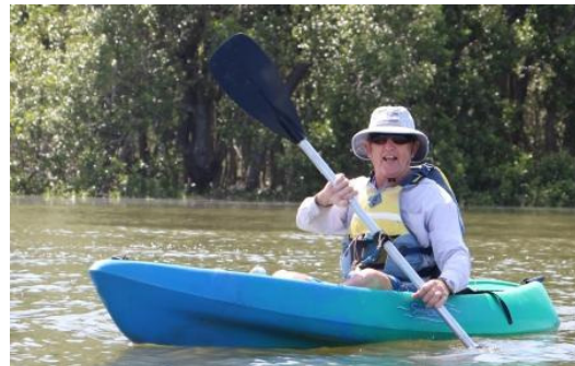
Our Leader wearing "plastic"