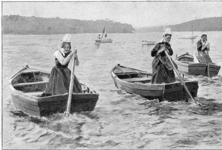
Une fête nautique devant l'Abri du Marin : joute à la godille des filles de pêcheurs

To fill up the space, here is a nice engraving of fishermen's wives racing .